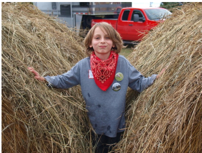
Harvest Homecoming pics